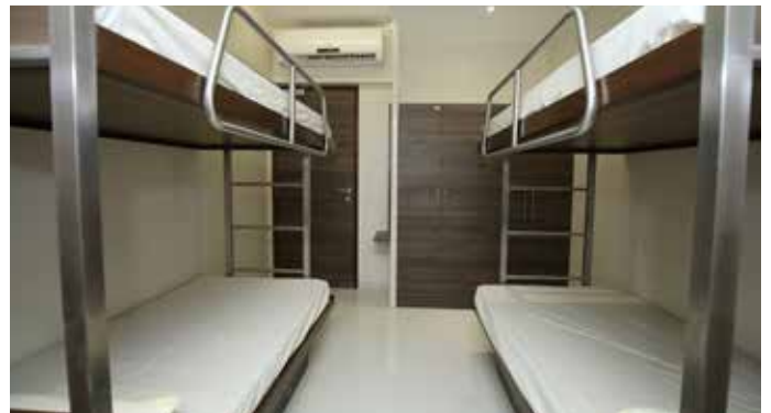
Quadruple Sharing Room